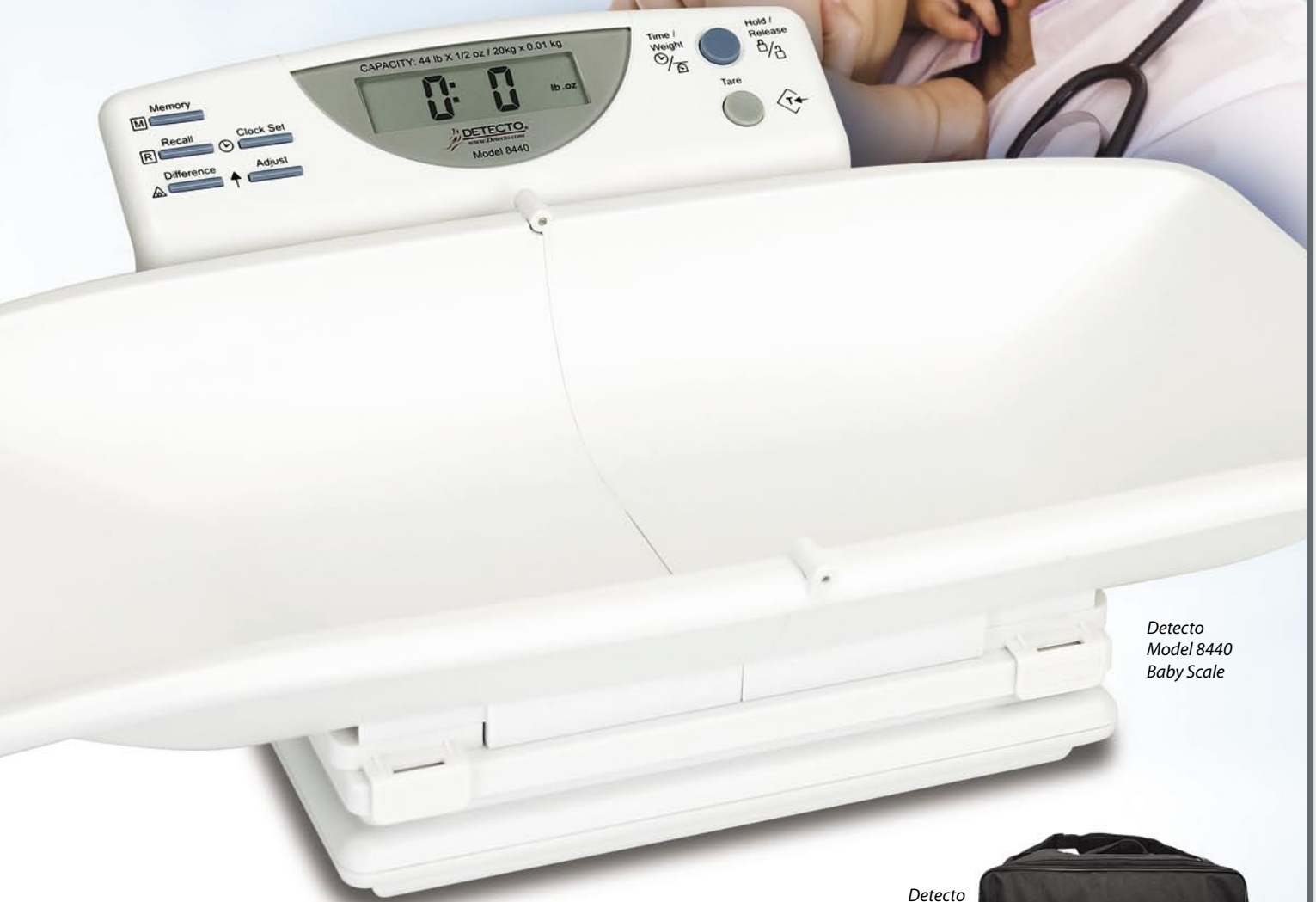
Detecto Model 8440 Baby Scale

Providing accurate and safe weighing of infants and toddlers, Detecto's model 8440 digital scale is ideal for home health and medical clinics. The 8440's weighing tray may be removed for standing toddler weighing and for easier transport. The 1-in / 25-mm high LCD offers pounds and kilograms readouts plus features a built-in clock. The scale's Weight Difference key provides the weight difference between the current weight on the scale and a saved weight in memory along with its time and date.