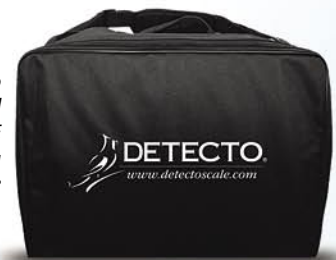
Detecto Model 8440-CASE Carrying Case

Providing accurate and safe weighing of infants and toddlers, Detecto's model 8440 digital scale is ideal for home health and medical clinics. The 8440's weighing tray may be removed for standing toddler weighing and for easier transport. The 1-in / 25-mm high LCD offers pounds and kilograms readouts plus features a built-in clock. The scale's Weight Difference key provides the weight difference between the current weight on the scale and a saved weight in memory along with its time and date.